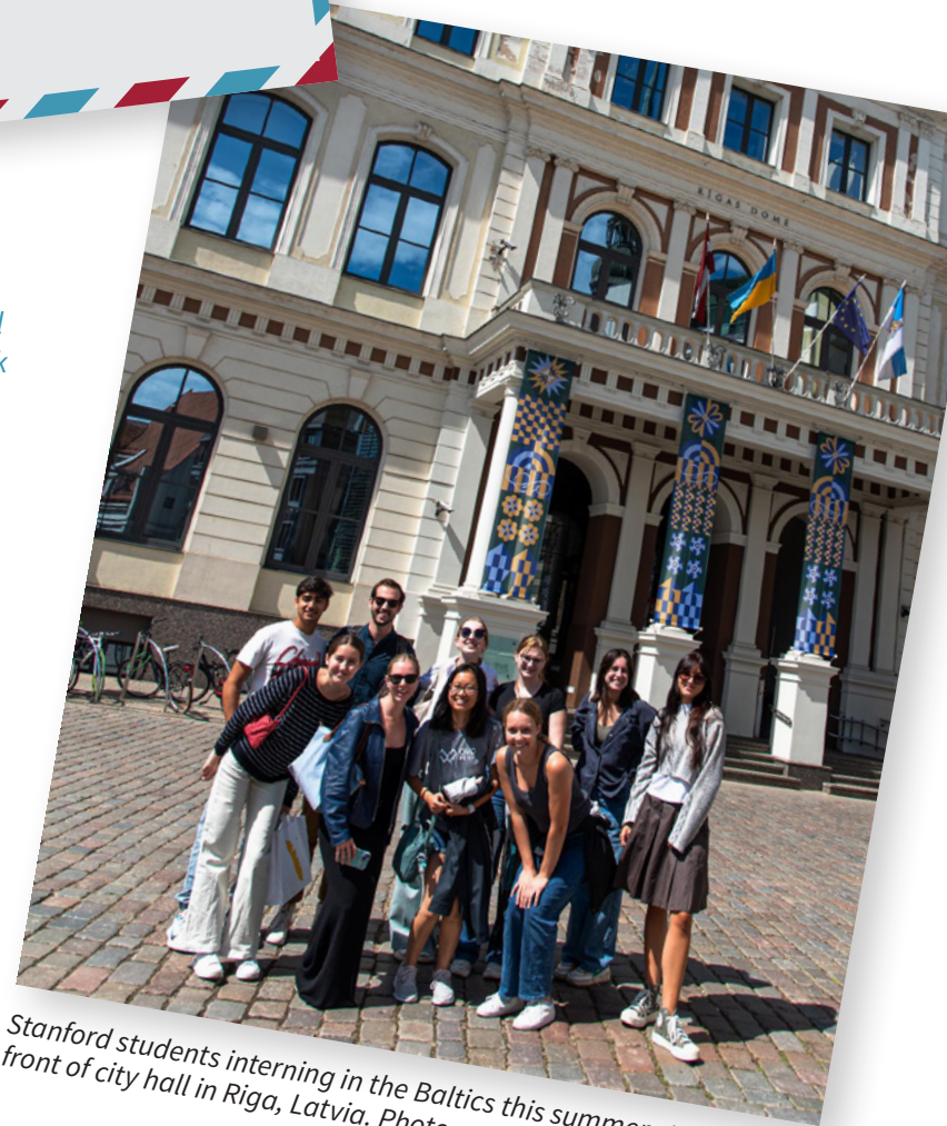
Stanford students interning in the Baltics this summer stand in front of city hall in Riga, Latvia.